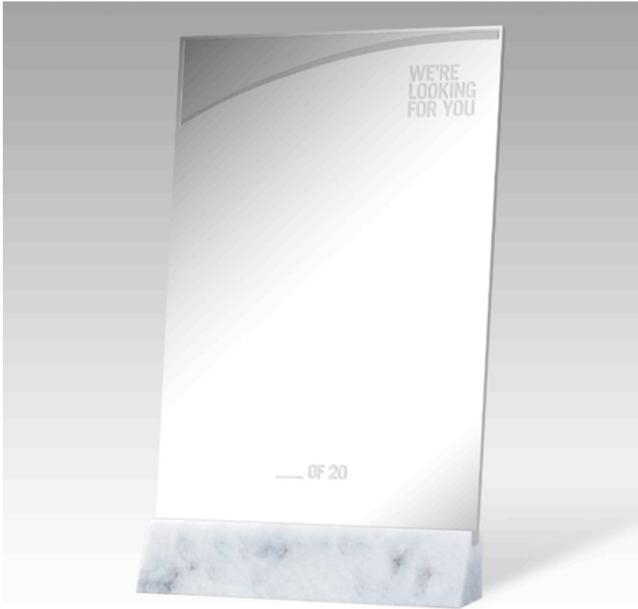
Rendering of Limited Edition trophy for The Armory Show, 2013 Courtesy of the artist

pleasing; it's the anti-art art. As the Armory Show celebrates the one hundred year anniversary, let's not forget the amount of art that has crossed our paths. In reference to a Duchamp readymade, Laser removes the object, the signature (no R. Mutt here), and for many a comfort zone regarding how one might want to experience art. Then again, the distorted female form and faces made by Picasso on large, painted canvases were probably not always comfortable, easy to understand or digest. As the commissioned artist for 2013, Liz Magic Laser dives head first into a conceptual well, filled with thirst and willing to yield a particular unexpected water for those ready to drink.