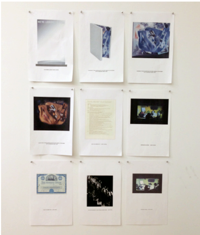
Still of thearmoryshow.com website

KDH: Before you mentioned cinema and the concept of a silhouetted figure standing in front of a rectangle. My first visual was of that of viewers standing in front of a painting in a museum. I like that your thought and vision actually transporting the concept to a more contemporary time, dealing with celluloid. The scene, or image of the silhouetted figure in front of a rectangular shape is not new but changes and evolves over time. What you are talking about also seems to have a direct relationship to voyeurism.