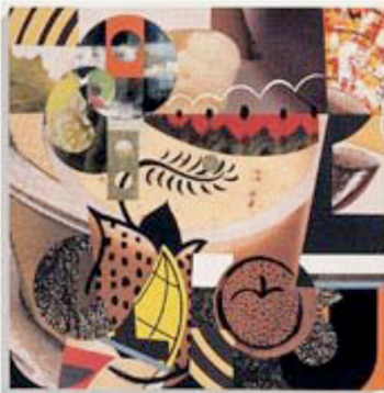
Roy Dowell Untitled #469 1990 Margo Leavin Gallery